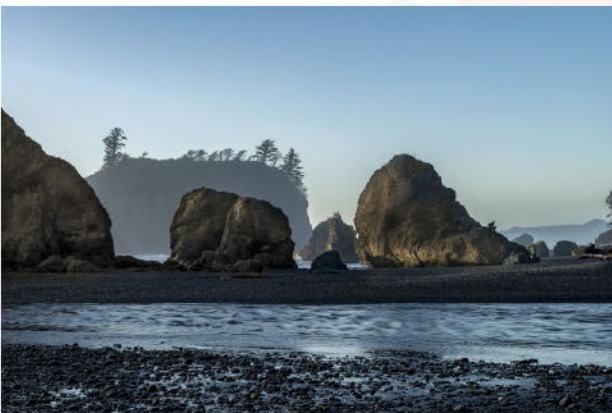
Olympic National Park

Participating in activities will earn you points. Points earned between January 1, 2017, and September 30, 2017, are used to establish eligibility for the 2018 wellness incentive. Here are a few fun activities that will generate points: