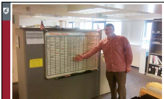
ORSO Dashboard "Before"