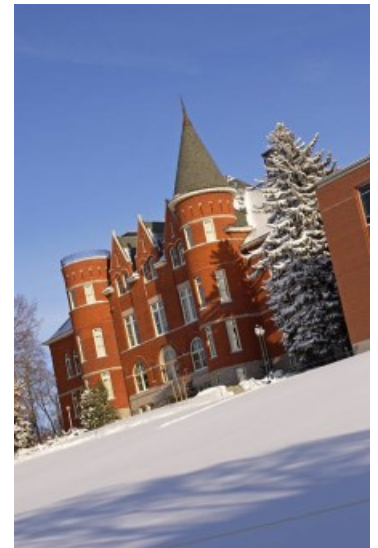
Thompson Hall

Questions? Please contact Human Resource Services at 509-335-4521 or hrs@wsu.edu .