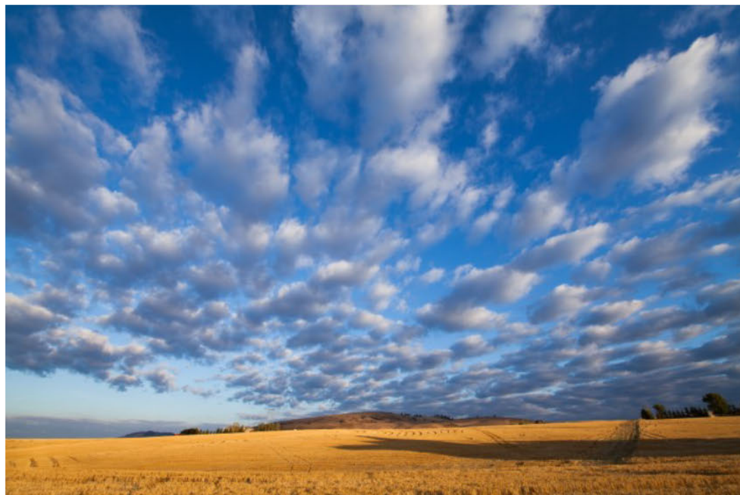
Palouse field and clouds